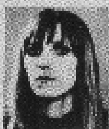
Ensslin, Gudrun G. 2. 11. 1940, Berlin