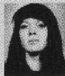
Ottinger, Ulrike U. 2. 11. 1944, Berlin