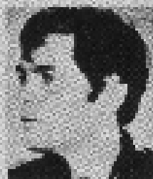
Baader, Andreas A. 2. 12. 1942, Berlin