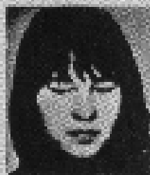
Meinhof, Ulrike M. 2. 11. 1926, Berlin

Wegen Beteiligung an Morden, Sprengstoffverbrechen, Banküberfällen und anderen Straftaten werden steckbrieflich gesucht: